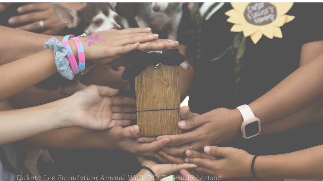
Dakota Lee Foundation Annual Walk